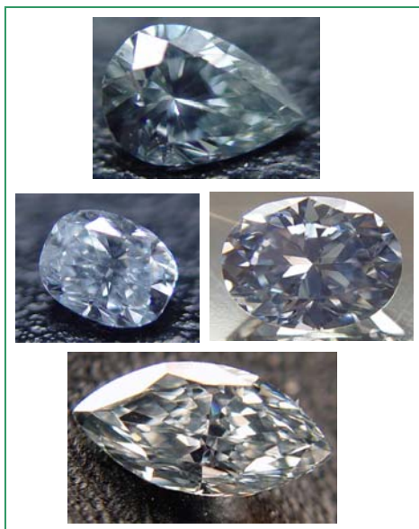
Pear Shape Fancy Gray-Blue (top), Cushion Fancy Blue (middle-left), Oval Intense Blue (middle-right) and Marquise Fancy Light Blue. (bottom)

ticeable hints of blue throughout the stone and certified as a blue-gray , or bluish gray . The differences between blue diamonds and grey diamonds are often subtle. Before deciding that a blue diamond is not for you, or your budget, it may be worthwhile to consider gray as a close substitute.