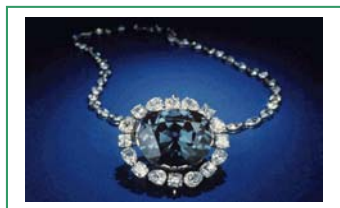
The Hope Diamond

blues and grey-blues are found in areas in South Africa and Australia.